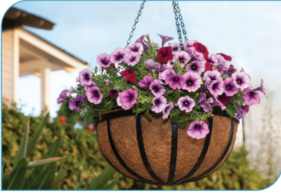
Coir Garden Articles