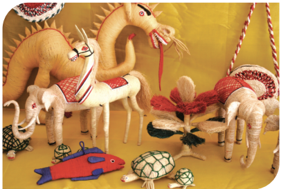
Coir fibre Handicrafts