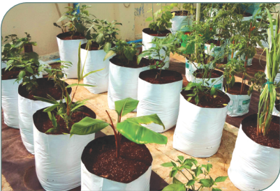
Coir pith Grow bag