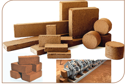
Coir Pith Blocks