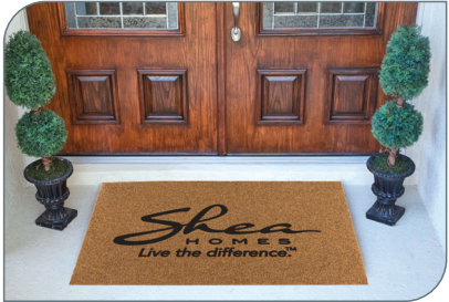
PVC tufted mat