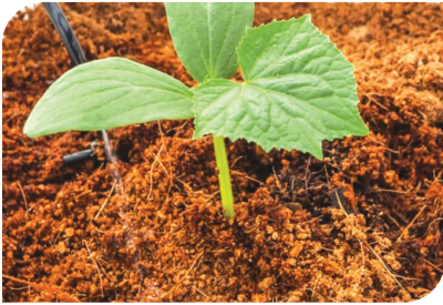
Coir Pith Manure