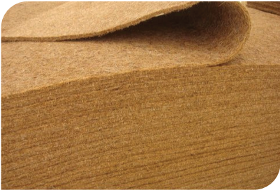
Coir needled felt