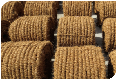
Curled coir rope